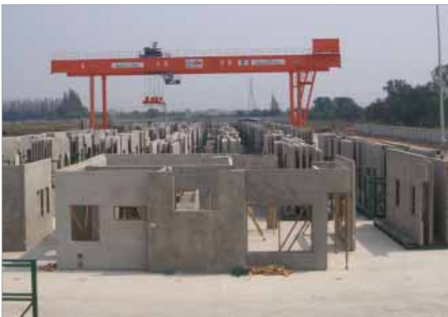
Gantry Crane and stockyard

Dudik International Kübelbahnen und Transportanlagen GmbH Mackstraße 21 88348 Bad Saulgau, GERMANY T +49 0 75818877 F +49 0 75814692 Dudik@t-online.de www.dudik.de