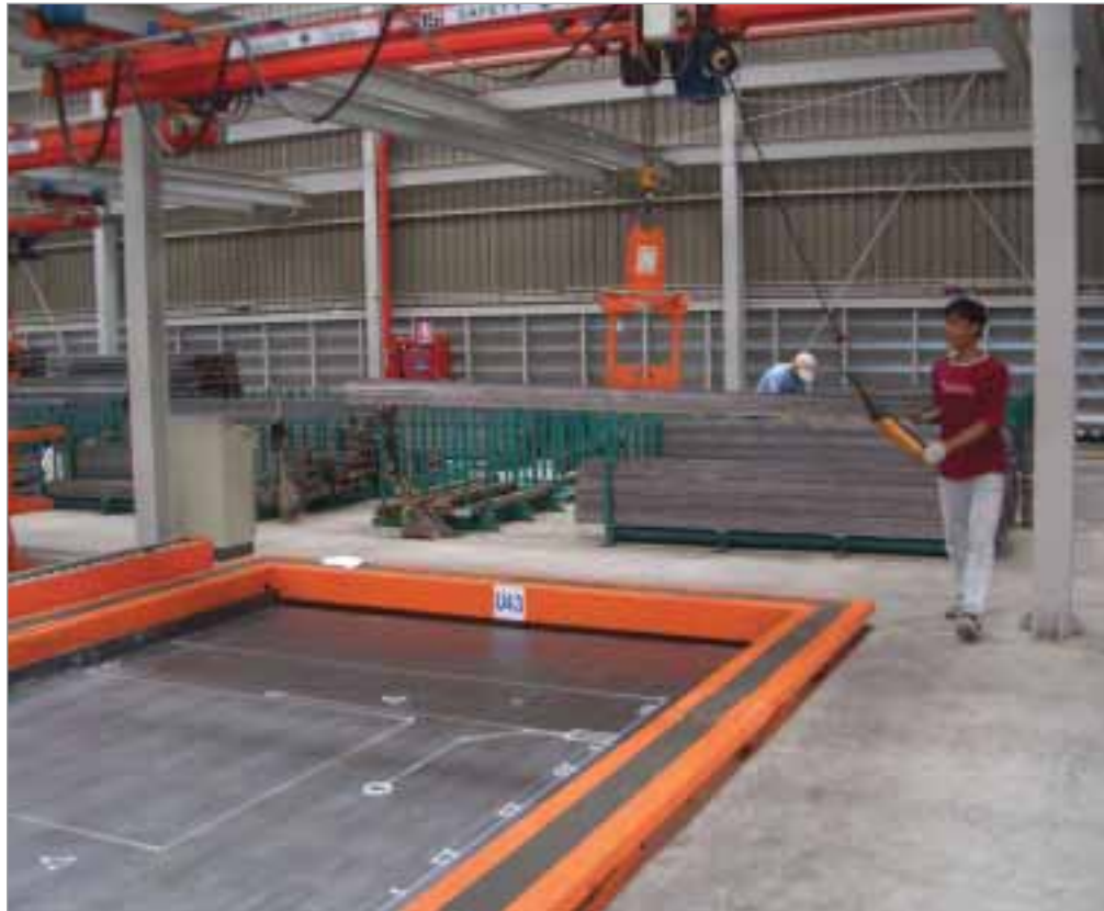
Placement of moulds

Steel moulds which are not needed for the actual production unit can be taken from the conveyor and be placed in the stocks.