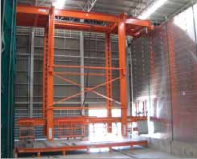
Rack operator and curing chamber

crete elements in such a way that they have a very fine and smooth surface, ready for painting.