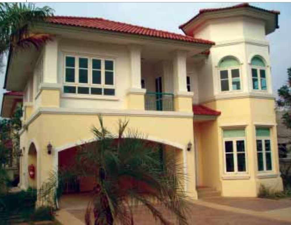
Typical Preuksa house

On the construction site, several other problems could be observed. Refinishing the buildings was an undertaking that required a lot of effort, dimensional tolerances and poor joints being the main problems. Apart from the vertical connections between individual elements, horizontal connections, where apart from the walls also