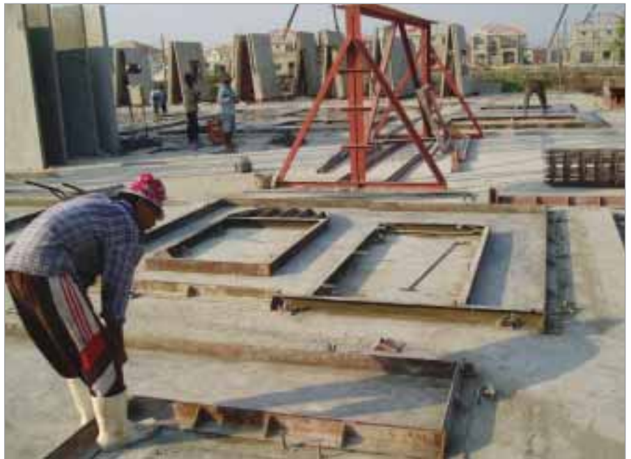
Preuksa casting yard

For Preuksa as a provider of real estate homes, the market situation is such that with existing capacities the demand could not be met at all. The challenge of planning and implementing these high expectations on the part of Preuksa was taken up by Christian Prilhofer Consulting, Uni-technik, Vollert, and Weckenmann, that had jointly worked on several projects before.