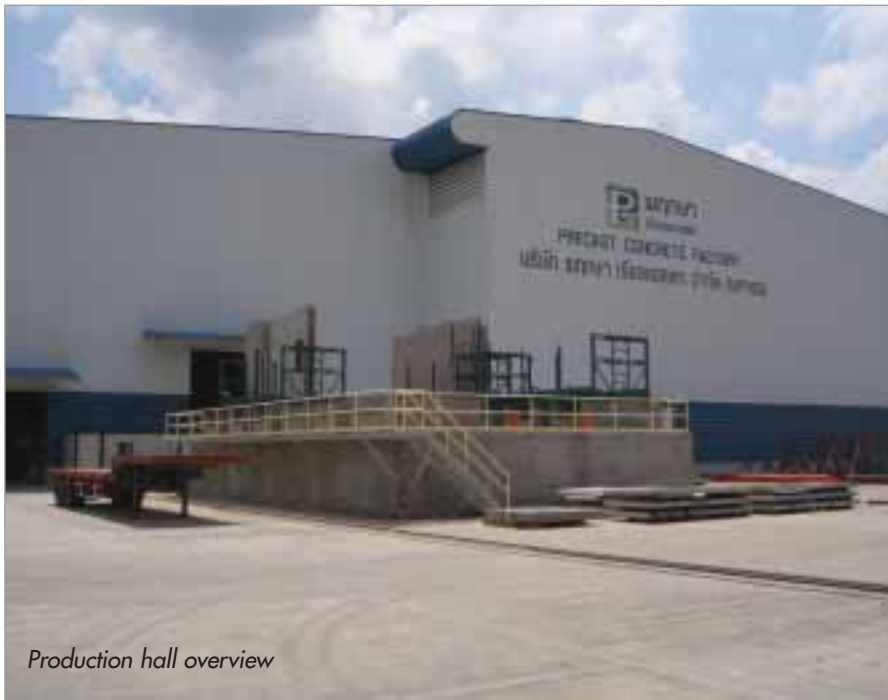
Production hall overview

requirements for constructional execution had been posed by Preuksa. Two-storey buildings were to be erected as solid-wall houses. The first floor walls had to have a thickness of 120 mm, those of the second floor 100 mm. Only some parts of the garage section were required to have a wall thickness of 200 mm.