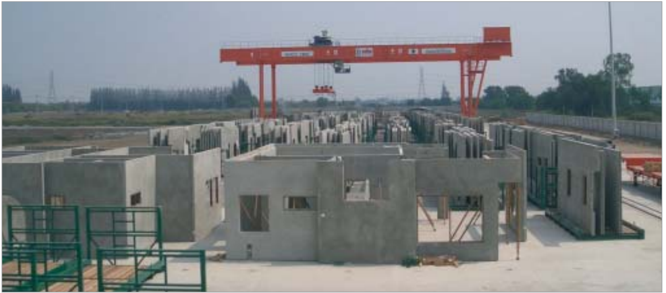
About 110,000 square meters of wall elements can be produced per month in this new facility

processes in the production plant. The master computer monitors the storage period - oriented towards a building site - in the heated high bay racking, it also monitors the sequential removal of cured elements from stock. The wall panels are stripped the next day, immediately transported to the building site and assembled there.