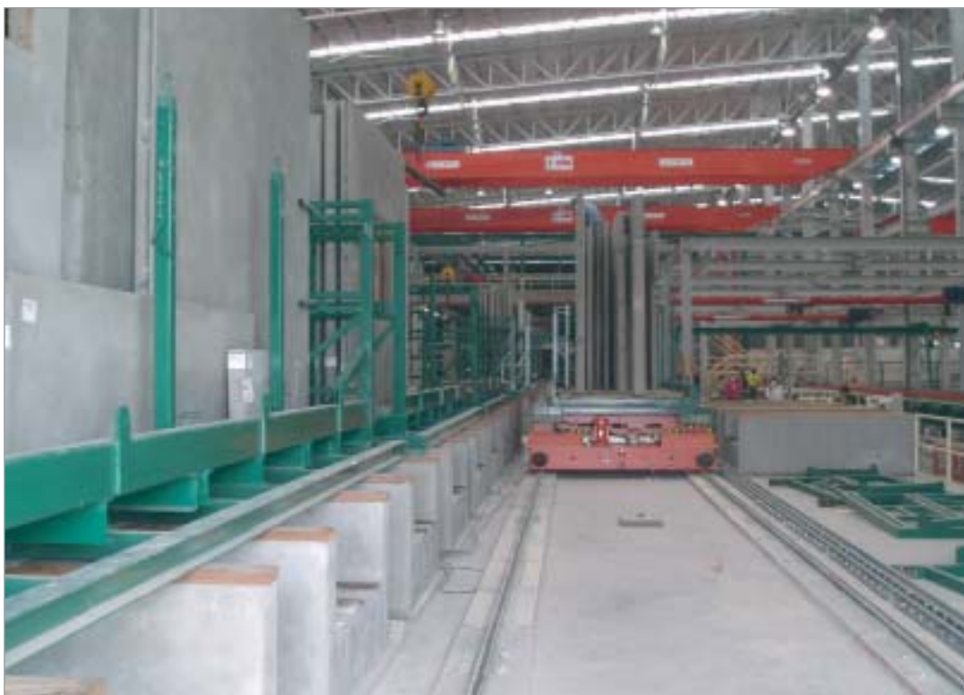
The spectacular hall dimensions are a tribute to the gigantic production capacity layout

The flow of material within the plant is carried out by a palette circulation system which transports the formwork palettes to the work station in a minute cycle – this guarantees flexible logistics in the production process. This circulation system was delivered together with high bay racking to dry the manufactured concrete elements by the plant engineer Vollert. A formwork palette filled with concrete can weigh up to 22 tonnes and therefore demands that the system is of a certain size. Unitechnik's central master computer supplies the work stations with manufacturing data and coordinates all the automatic